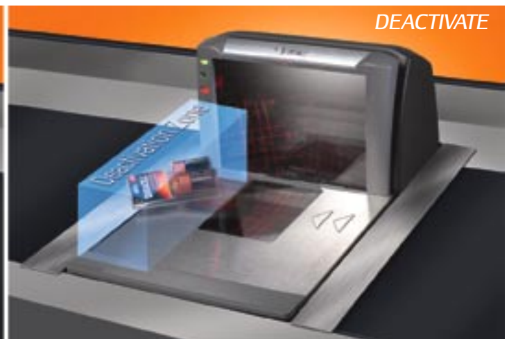
The Magellan 9500 scans and deactivates in one pass