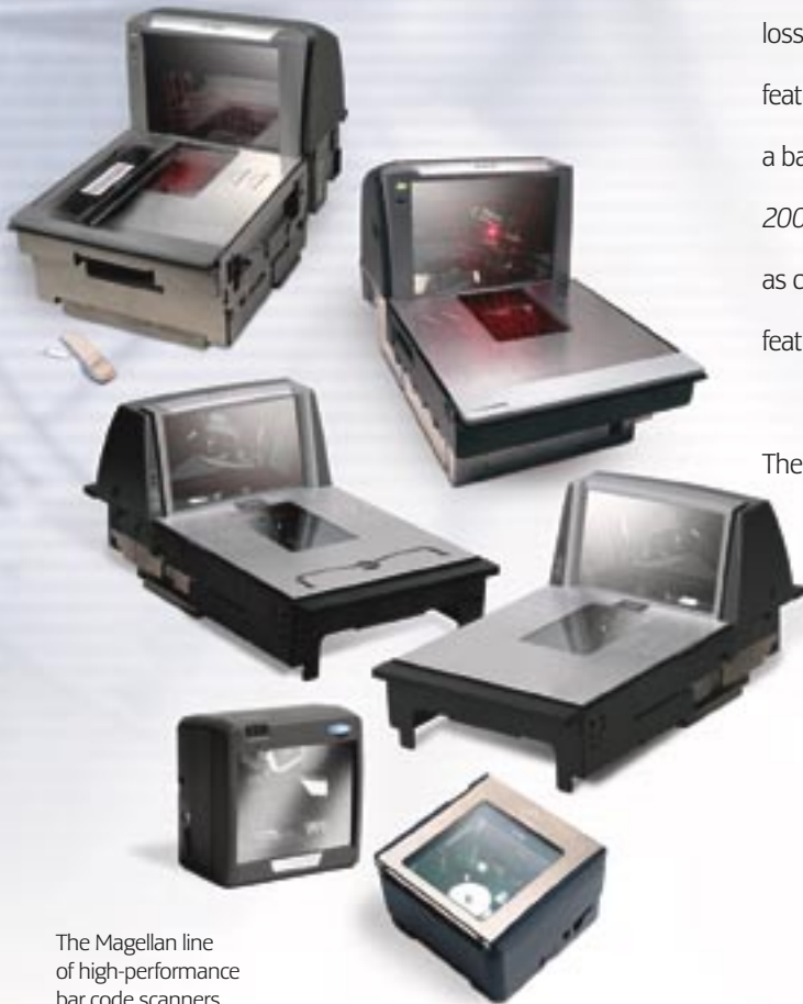
The Magellan line of high-performance bar code scanners

The complete Magellan line of scanners are built from a common platform with common features to increase productivity and enhance POS system efficiency.