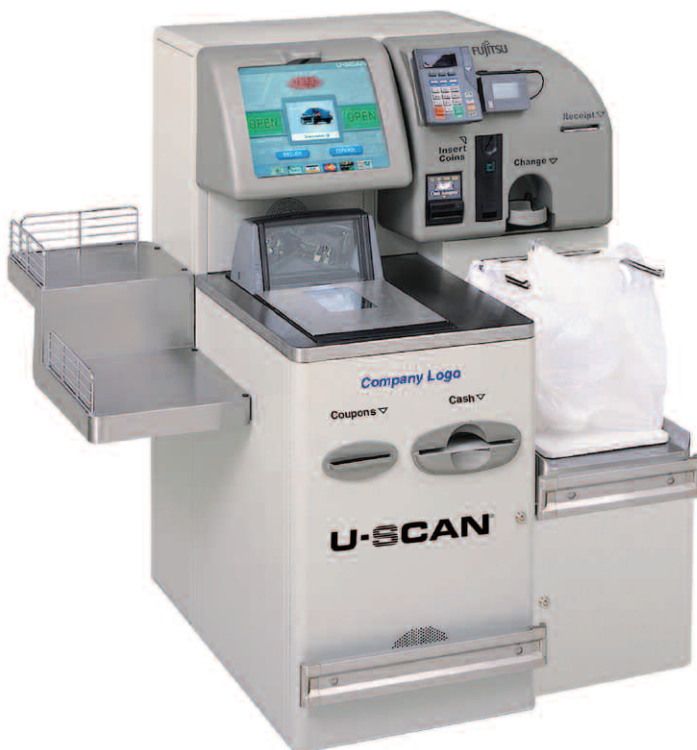
Compact, single-bag solution