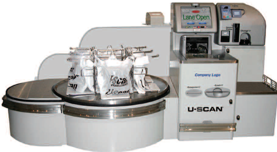
Ease of use for large orders