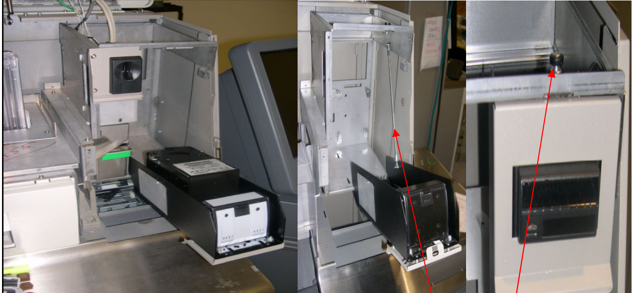
Unit without Lanyard or Plunger (Needs Upgrade)