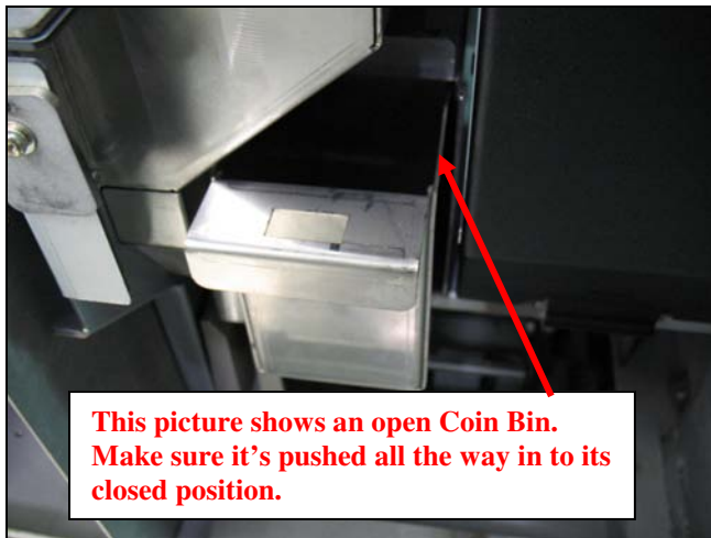
Genesis Front View