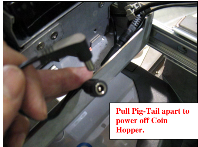
Pull Pig-Tail apart to power off Coin Hopper.