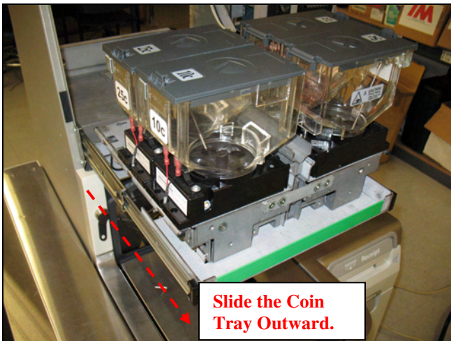
Slide the Coin Tray Outward.

If the Coin Hoppers are on the Left, the Hopper Power Switch is accessible on the Left side of the Hopper Assy. The separate Power Pig-Tail is not added. See Pictures Below.