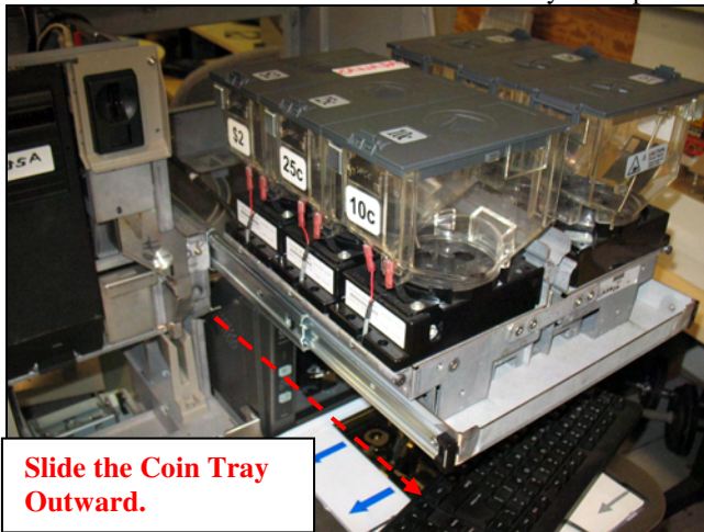
Slide the Coin Tray Outward.

If the Coin Hoppers are on the right, slide Coin Hopper Tray outward and unplug the power from the Pig-Tail. The Power Pig-Tail cable is located in the rear of the Coin Tray. See pictures below.