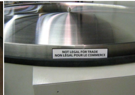
Carousel (1 label shown)