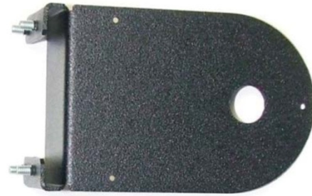
Camera Bracket (attaches to Upper Door)